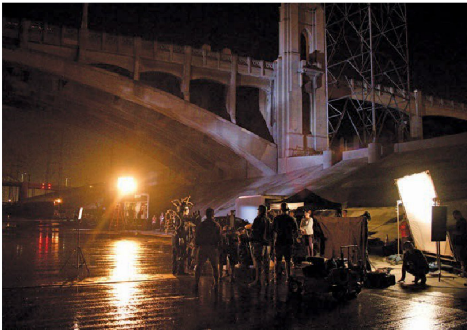
Top: Under the Fourth Street Bridge, crewmembers prepare for the scene in which the daughter lights the fuse to her father's fireworks suit. Bottom: Durald readies a Red Epic for the fireworks scene.