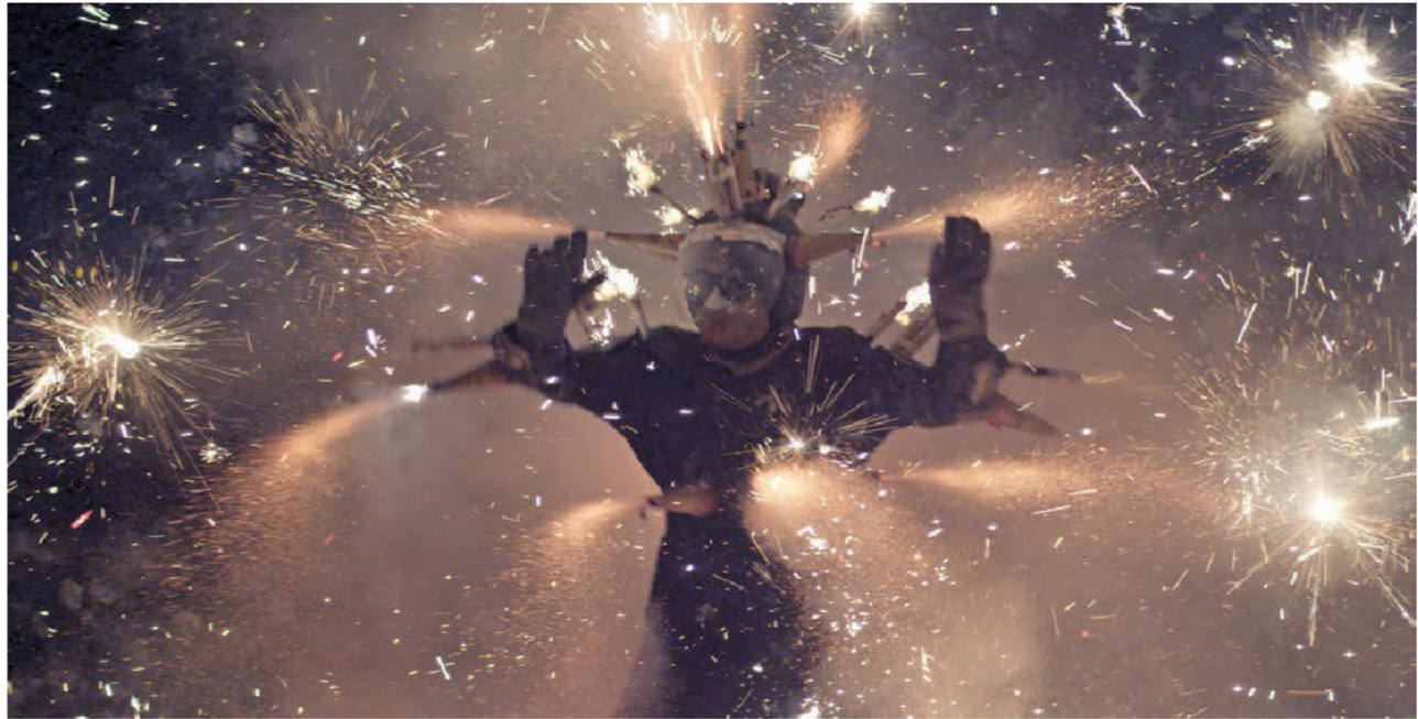
Cinematographer Autumn Durald captured this climactic fireworks display for London Grammar's music video for "Strong."